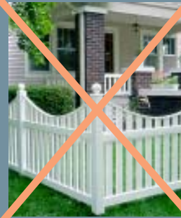
The closed scallop picket and spindle picket- not acceptable styles

The gothic, ball, pyramid, and molded decorative cap are allowed on fences occupying a NU-Lot.