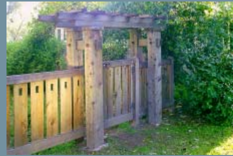
Natural wood fence- acceptable height, color, and design

Required. All fences shall remain their natural color. Painting of the wood is not allowed.