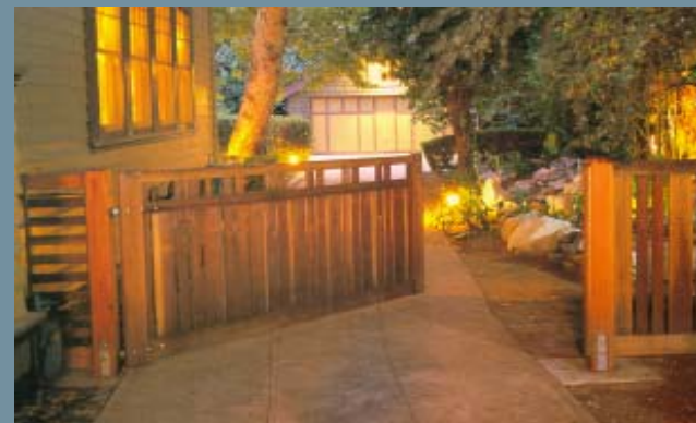
4' side yard wood fence and gate