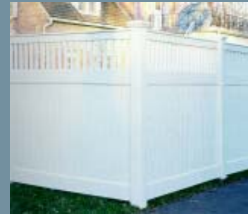
Acceptable privacy fencing—solid opaque to 4' with picket/lattice above