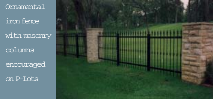
Ornamental iron fence with masonry columns encouraged on P-Lots