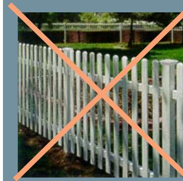
3" wide pickets not acceptable on NU-Lots