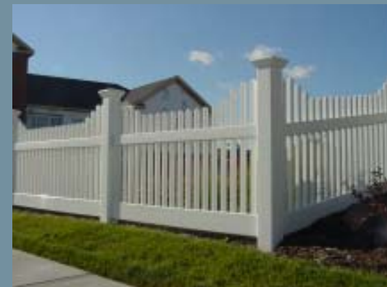
4' vinyl fence with 1 3/8" stepped pickets