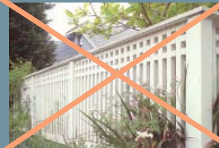
Painted wood fence- not acceptable