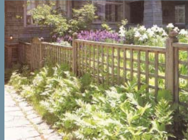
Cedar stepped fence with lattice design

Three (3) to four (4) foot fences are encouraged.