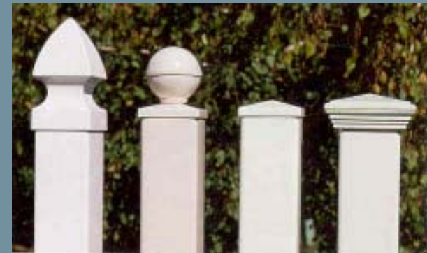
Examples of acceptable cap styles